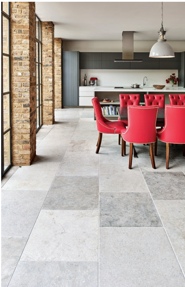
60 X RANDOM X 2CM