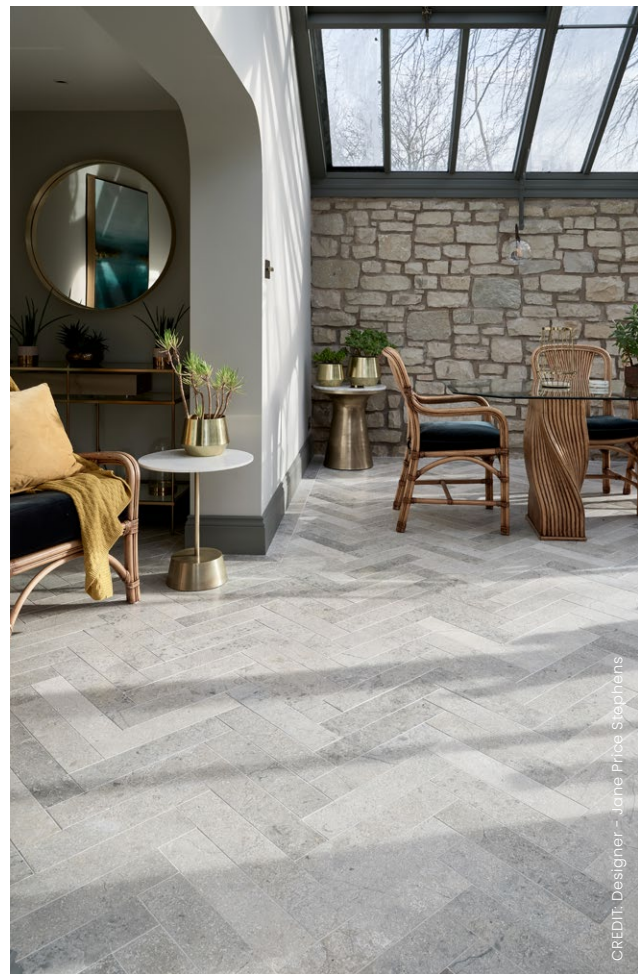
9 X 40 X 2CM