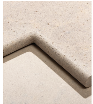
POOL CORNER PIECE