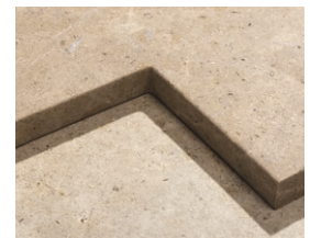
POOL CORNER PIECE