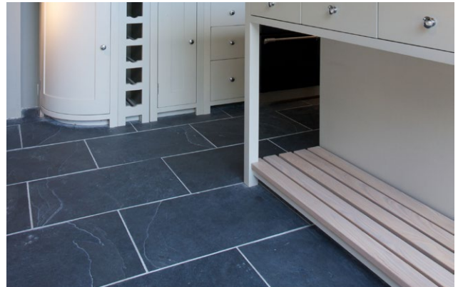
40 X 60CM TILE