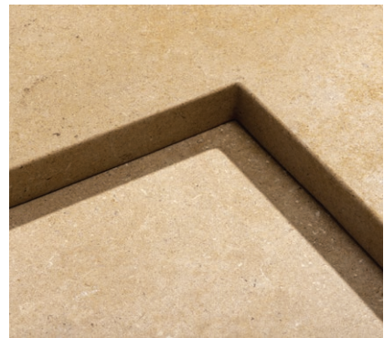
POOL CORNER PIECE