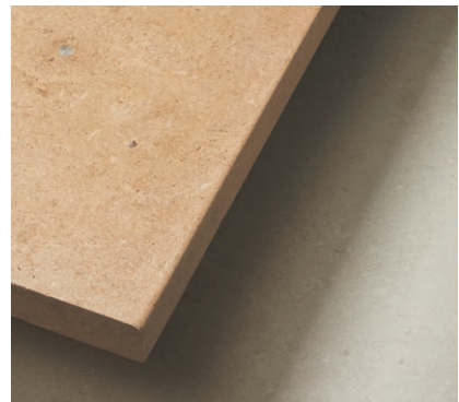
DOUBLE PENCIL COPING