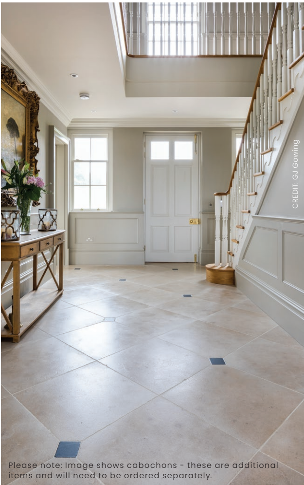
60 X 60 X 1.5CM