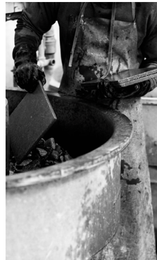
MATERIAL BEING TUMBLING IN THE VIBRATORY TUMBLING MACHINE; FILLED WITH WASTE PRODUCT