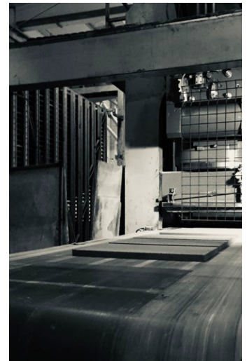
MATERIAL COMING OUT OF THE PRESS