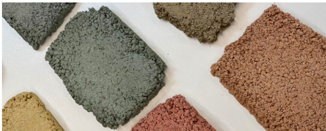
THE MIXTURE PRIOR TO PRESSING

The tiles that come out of the moulds are oversized; and these are subsequently cut to the correct size. This allows for greater size consistency. The cut tiles are then individually tumbled in the same way stone is, by being placed into a large vibrating bath, filled with waste broken tiles. The vibration causes the tiles to chatter against each other, softening the edges and giving some texture surface - this process is much like the weathering of pebbles on the beach.